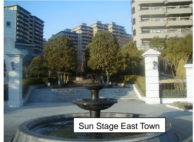
Sun Stage East Town