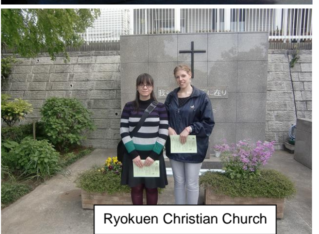
Ryokuen Christian Church