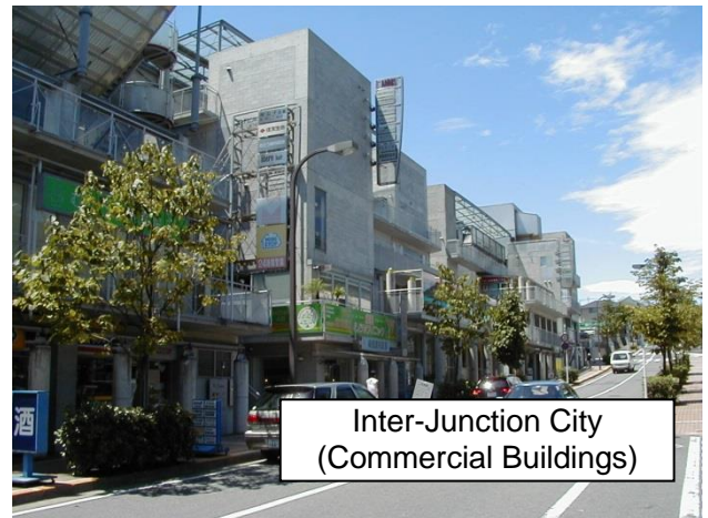
Inter-Junction City (Commercial Buildings)