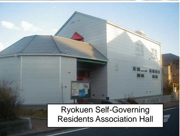
Ryokuen Self-Governing Residents Association Hall