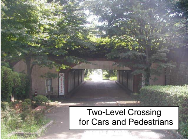
Two-Level Crossing for Cars and Pedestrians