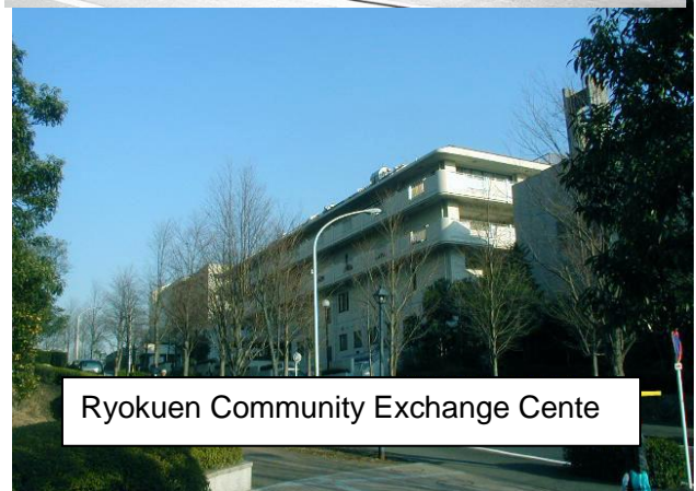
Ryokuen Community Exchange Center