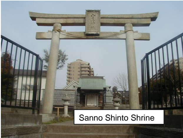
Sanno Shinto Shrine