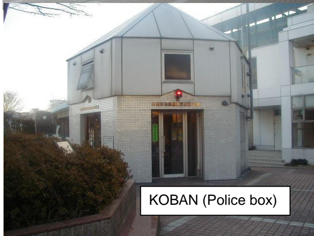
KOBAN (Police box)