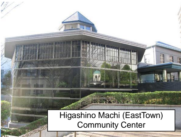
Higashino Machi (EastTown) Community Center