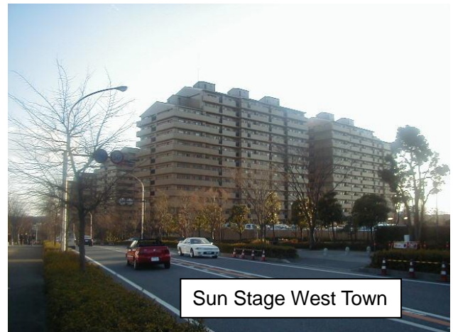
Sun Stage West Town