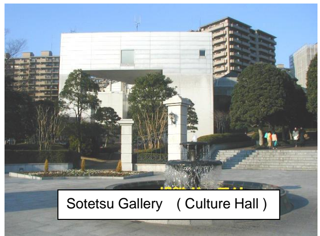
Sotetsu Gallery (Culture Hall)