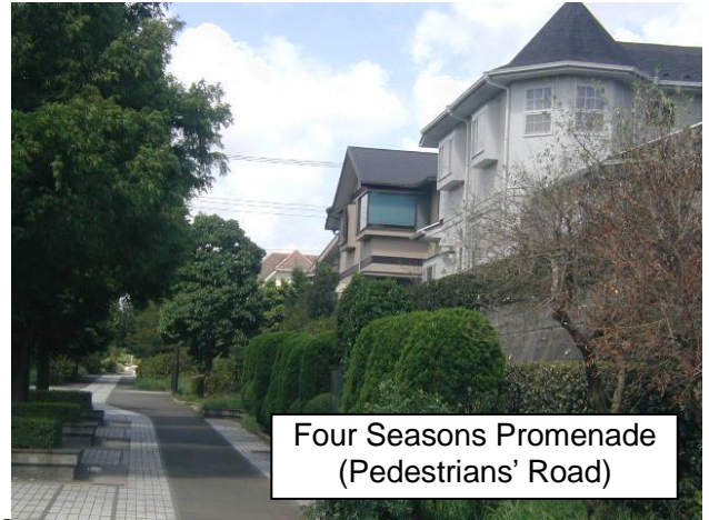
Four Seasons Promenade (Pedestrians' Road)