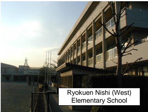
Ryokuen Nishi (West) Elementary School