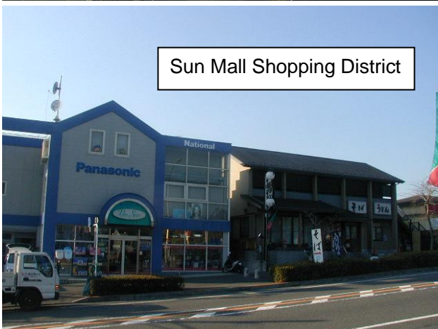
Sun Mall Shopping District