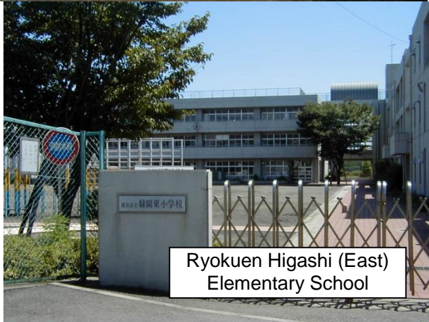
Ryokuen Higashi (East) Elementary School